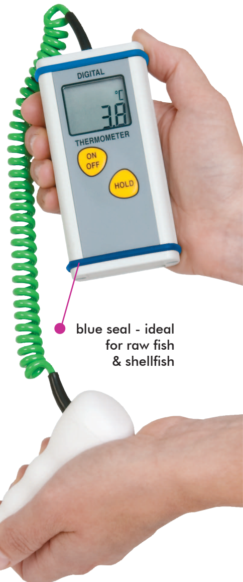
● blue seal - ideal for raw fish & shellfish